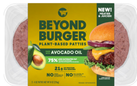
Beyond Meat Beyond Burger

The positive choices we make every day—no matter how small—can have a great impact on ourselves and the planet. At Beyond, we've taken the animal-based meal off the table, while still delivering the meaty, plant-based, better-for-you meals you crave.