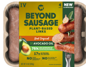
Beyond Meat Beyond Sausage selected varieties