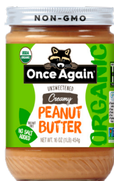
Once Again Organic Peanut Butter selected varieties

Spreading integrity since 1976, Once Again is a 100% employee-owned company that produces clean ingredient nut & seed butters and snacks. Our passionate employee owners take pride in fueling healthy lifestyles with small-batch, high-quality products crafted as close to homemade as possible.