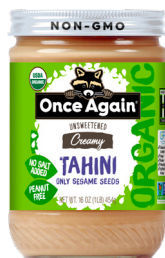
Once Again Organic Tahini